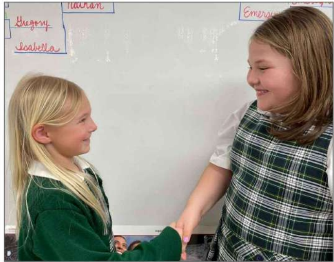
Two amazing players made it to the final round of the SSPJ third grade March Madness Multiplication tournament. Stay tuned for an update!