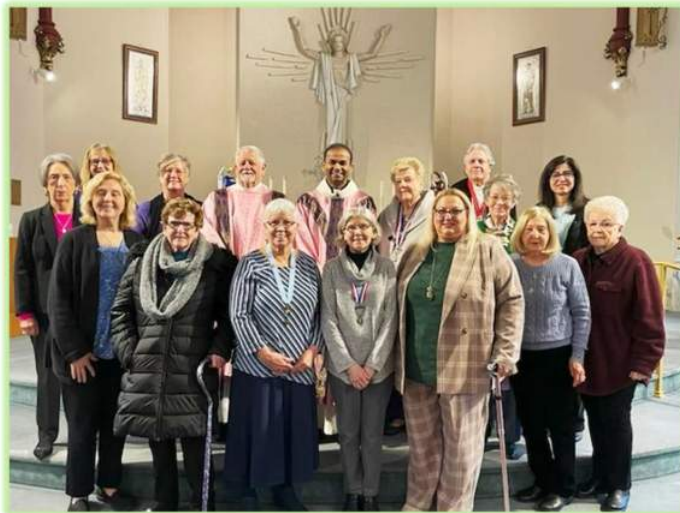
Celebrating 15 years of Service at St. Philip & St. James RC Church in the Diocese of Metuchen