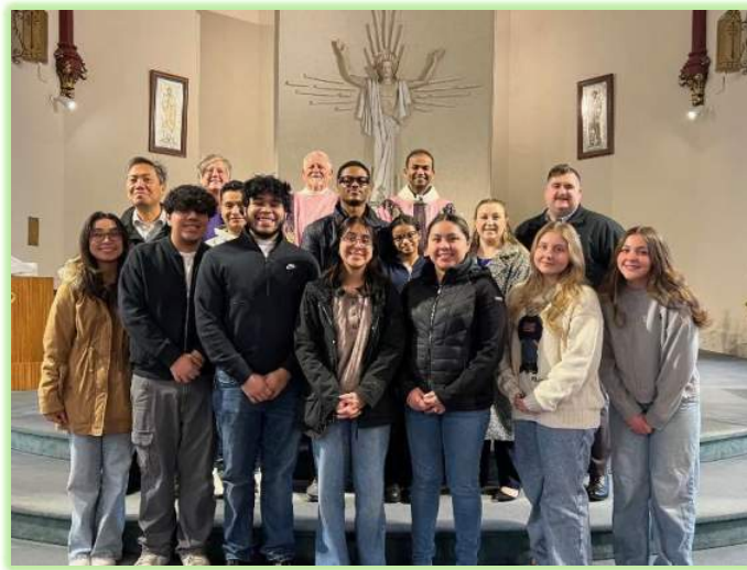
Laetare Sunday celebrating the Second Scrutiny